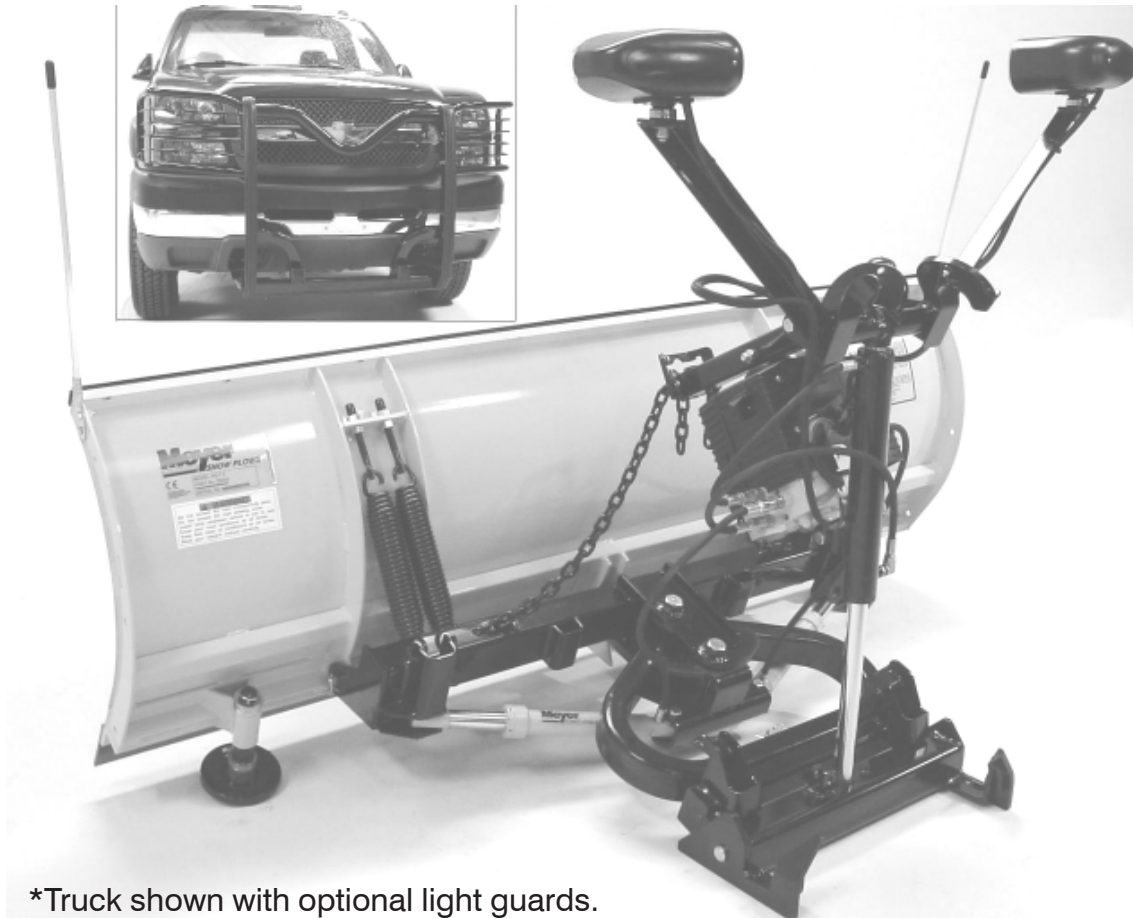
*Truck shown with optional light guards.